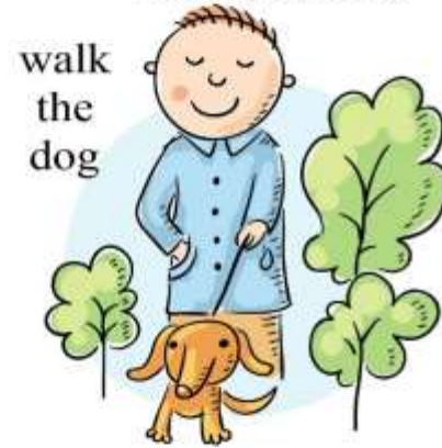
walk the dog