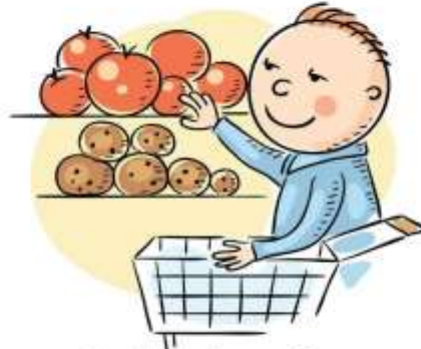
do the shopping