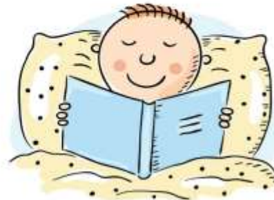
read a book