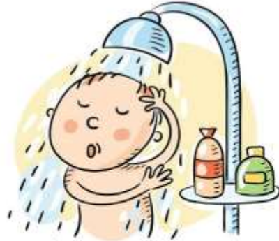
have a shower